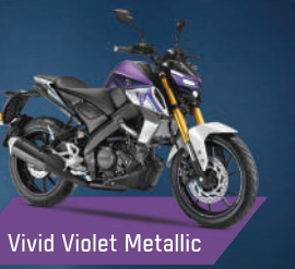
Vivid Violet Metallic