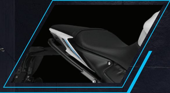
UNI-LEVEL SEAT WITH GRAB BAR