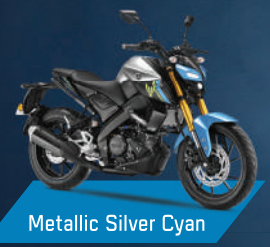
Metallic Silver Cyan