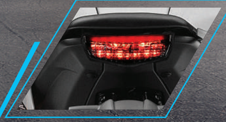
RAISED LED TAIL LIGHT