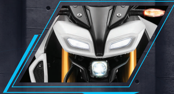
BI-FUNCTIONAL LED HEADLIGHT